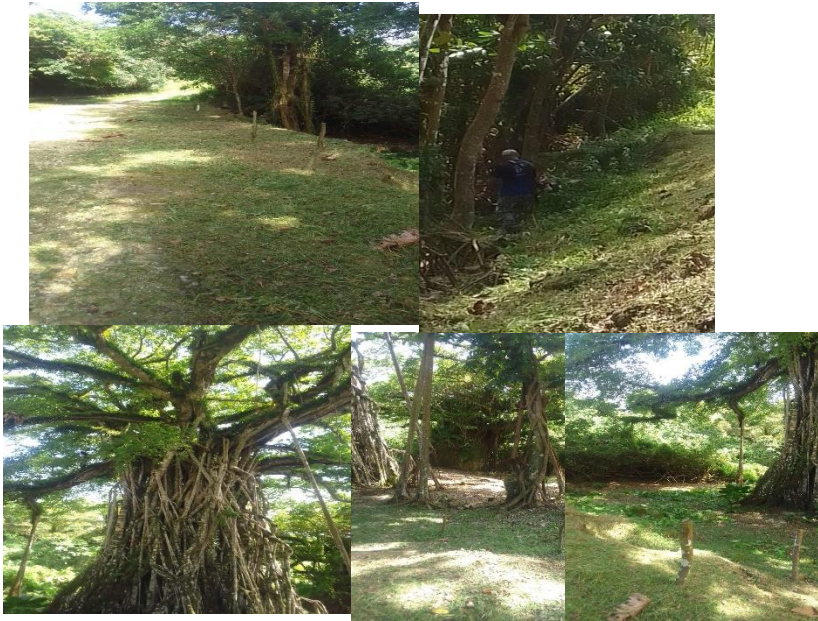
BIGGEST BANYAN TREE CLEANING PROJECT