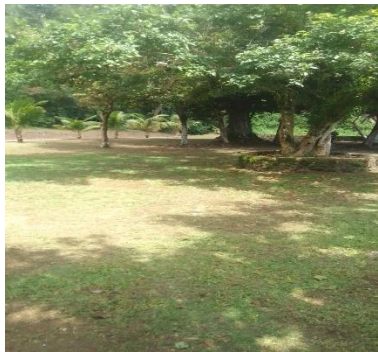
ALAGUAN BAY PROJECT SITE