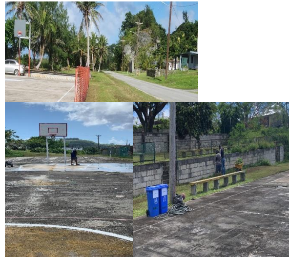
DISTRICT 1 BASKET BALL COURT PROJECT