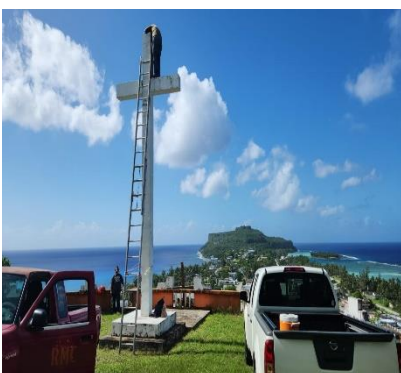
SETTING UP FOR CHRISTMAS LIGHTING