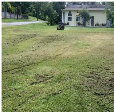
ASSIST WITH CLEANING THE SAINT JUDE CHAPEL