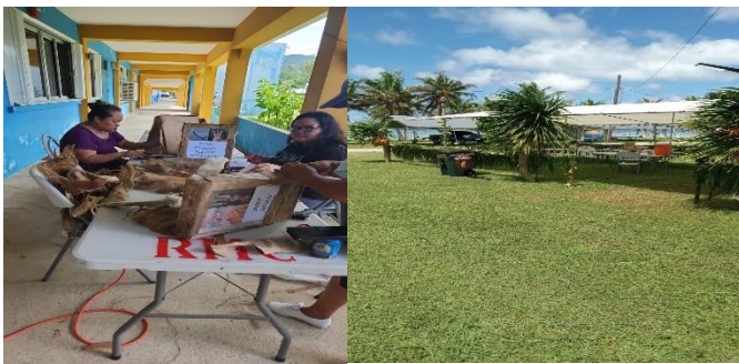
PREPARING FOR THE COMMUNITY FOOD, COCONUT CRAB, AND DEER HORN COMPETITION AT THE FIESTA