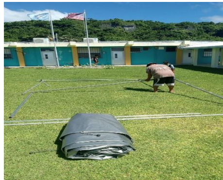
ASSIST SCHOOL WITH PICKING UP WITH TENTS