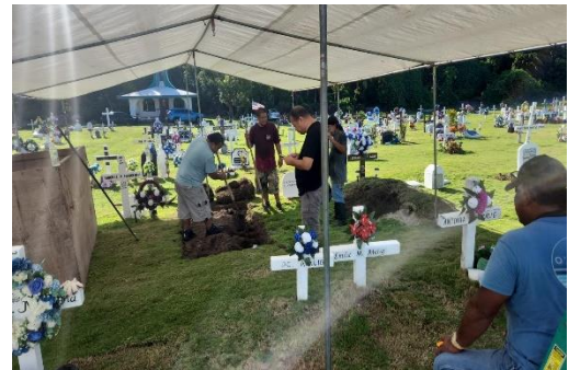
ASSIST THE COMMUNITY WITH FUNERAL EVENTS