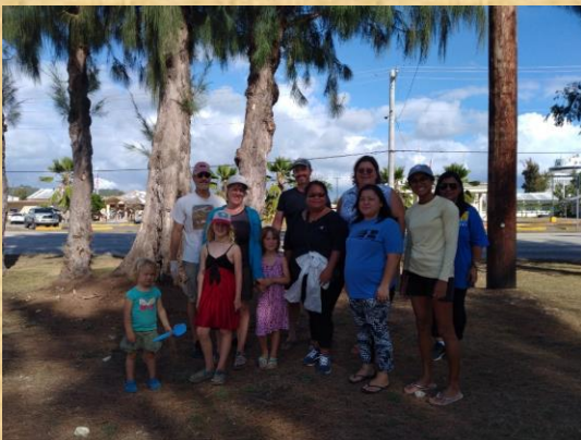
Top to bottom; support staff, the entire crew, support staff at work, beach clean up.

This information is based on our outgoing case/data management system. There is a margin of error to be considered for the difference between a fiscal year and a calendar year that we cannot control in the time matter data entry system; therefore, the following reports on data for calendar year 2023. Our Project Manager continues to need more training on report generating. Therefore, we need funding to continue training to this end.