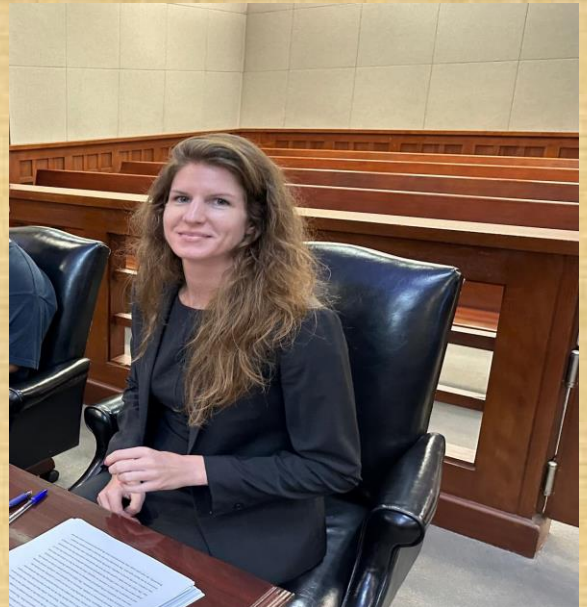
Right, lawyer taking the oath to practice law. Left, getting ready to argue to the Supreme Court.