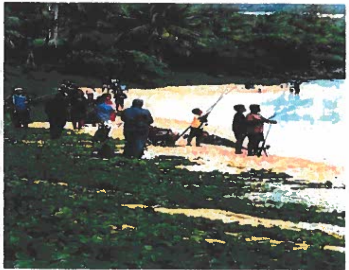
Tinian DLNR DFW 2024 Summer Youth Fishing Derby.