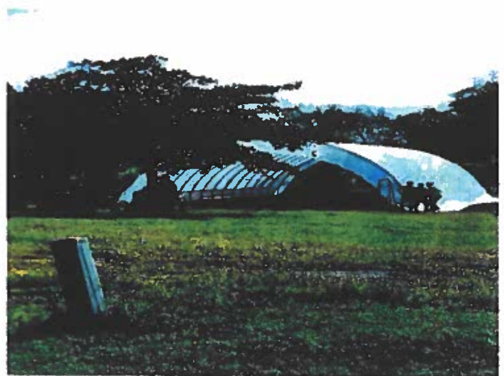
Tinian DLNR F.Y. 2024 FORESTRY PROJECTS.