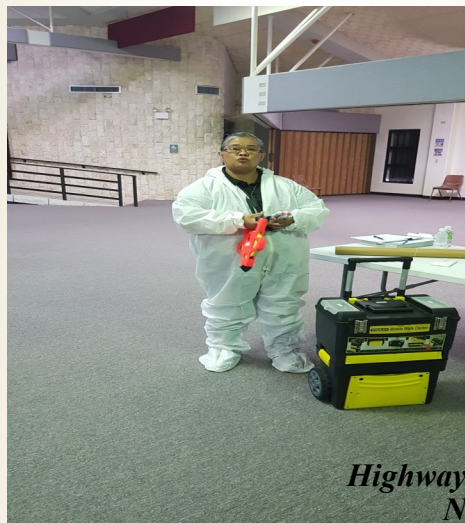
Highway Safety Office NHSTA