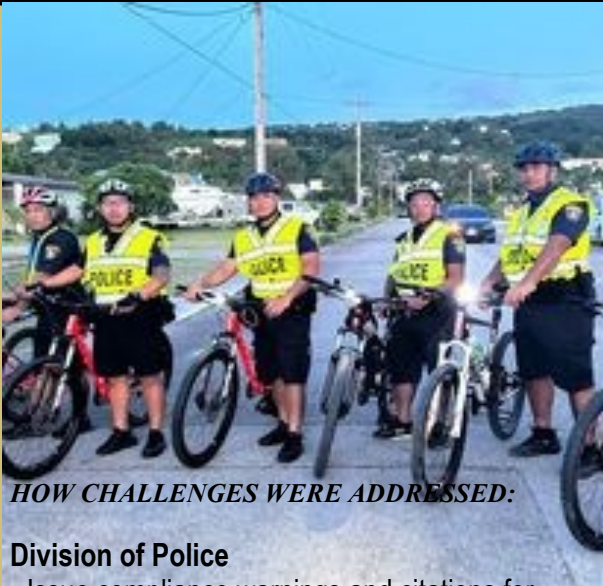
HOW CHALLENGES WERE ADDRESSED: