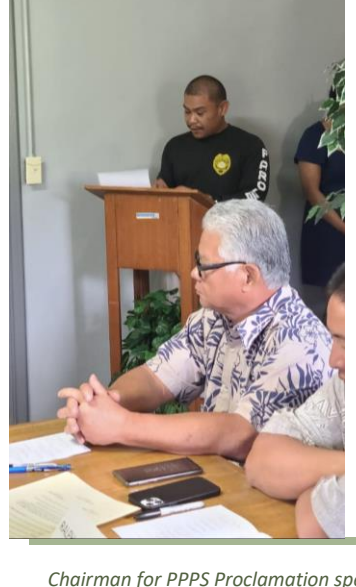
Chairman for PPPS Proclamation speech