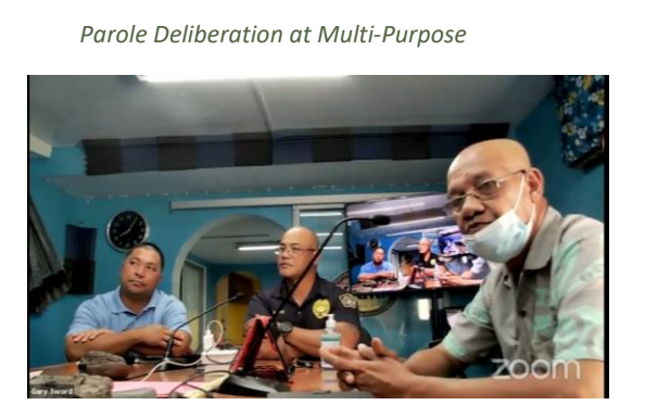
21st Pre-trial, Probation, and Parole Week Talk Show